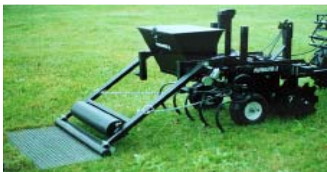
Tecomate Plotmaster Model 400

Fulfill your wildlife habitat improvement goals. We can provide you with free information, contacts, products and equipment to make your property come alive with wildlife. Stop in or contact us today.